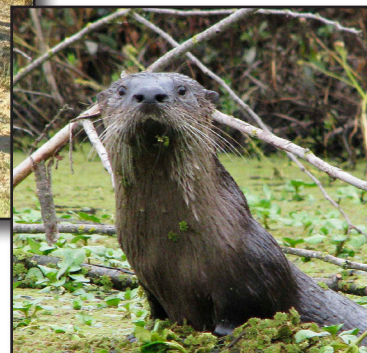
Your gift will help to restore wildlife habitat.

For information about making a year-end donation or to donate stock, please visit our website at www.lagunafoundation.org or contact Bev Scotland at (707) 527-9277, ext. 106 or bev@lagunafoundation.org .