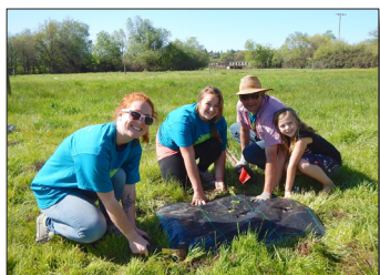
Come join the planting fun in 2015!

Help us celebrate our 25th Anniversary by joining us as a fundraiser for the 2015 Laguna Re-Leaf Day!