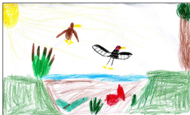
Learning Laguna student artwork.

The school year got off to a great start in September with two "brush-up" events for Docents: Breakfast in the Laguna and Classroom Catch-up. At Breakfast we come together for a lovely picnic and walk around the field trip site sharing tips and techniques for successful interactions and learning experiences for the students. Classroom Catch-up provides an opportunity to share advice & practice with the special Learning Laguna classroom activities: the Wetland Model, Migration Game, Bird Investigation Station, Who Am I? and Animal Tracks.