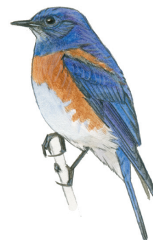
Male Western Bluebird (Sialia mexicana)

Designed to be used as a field guide companion, this 9-page checklist will help you keep track of your bird sightings throughout the year and will help you develop your own Laguna birds life list! This booklet is a must have for any bird watcher at any age! Look for it in the LEC gift shop, or order your checklist today for only $5 by emailing: christine@lagunafoundation.org .