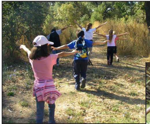
Your donation will provide year-round access for people of all ages to hike, kayak, and walk the Laguna.

Let's keep up the momentum! So much can be accomplished with the support of our friends and this generous matching gift.