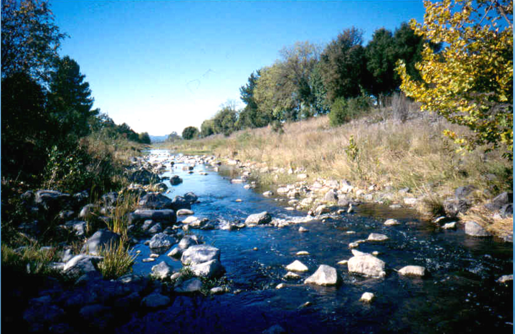
Santa Rosa Creek