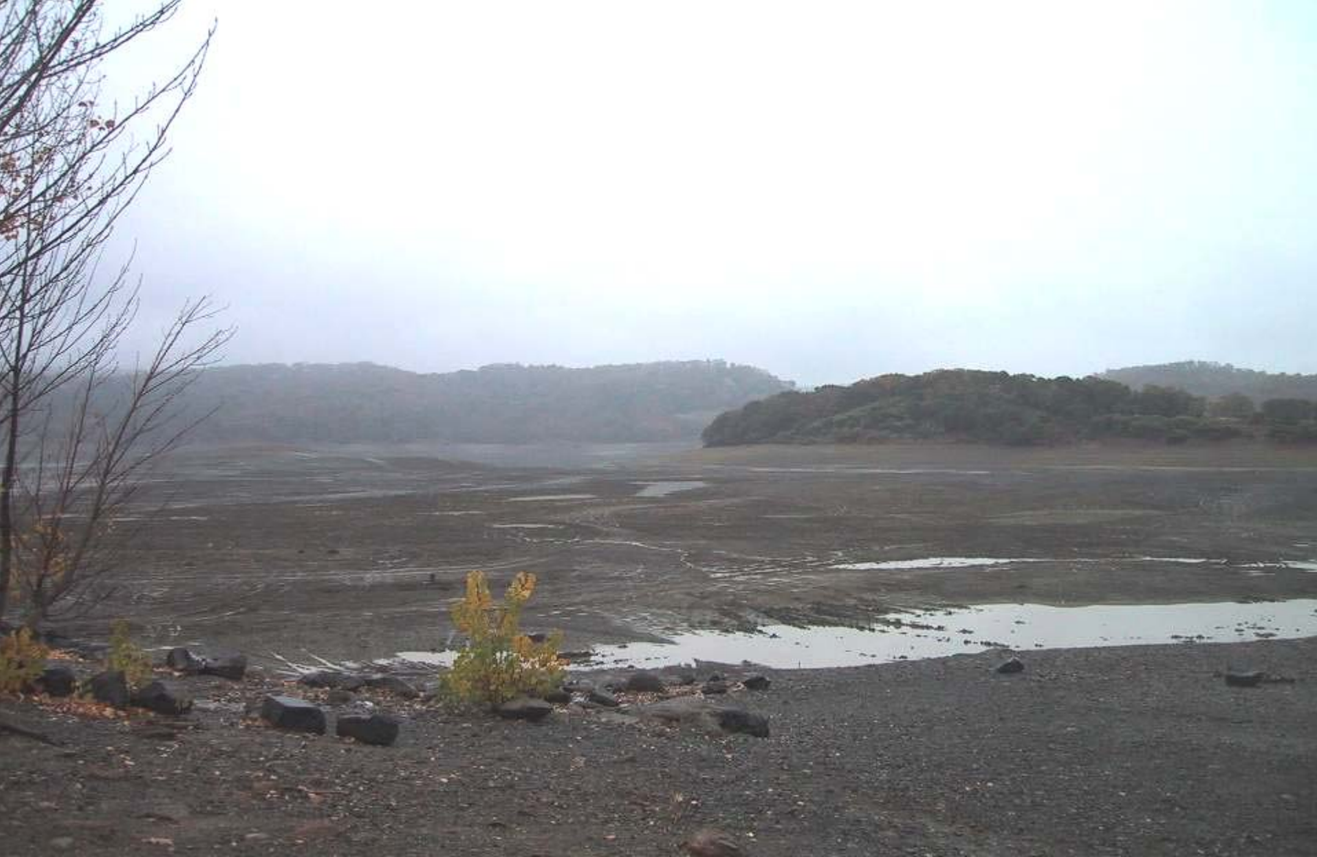
Lake Mendocino - October 2002