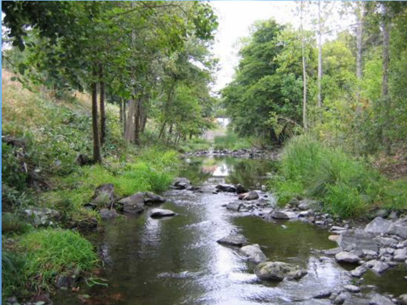
Santa Rosa Creek