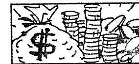
The U.S. Mint turns out about 17 billion coins a year.